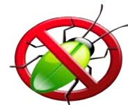
Bugs have got to go