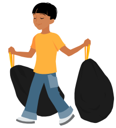
Your responsibility to keep your yard and the parking lot clean.